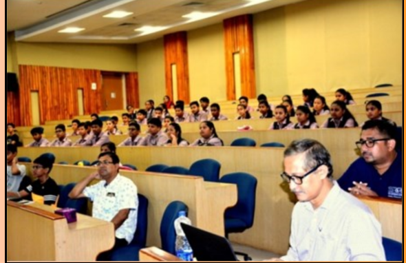
IITG Monitor ¶ Indian Institute of Technology Guwahati.

This was followed by a highly active interaction session with the audience comprising mostly of school students. There were also faculty and staff members of the institute who have benefited from the event.